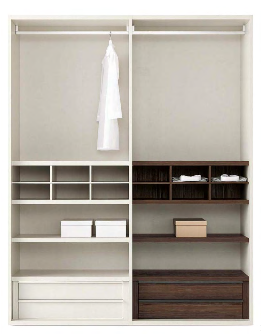
Structure interior in Linen-effect melamine, always with hanging rail and supports in Bianco colour