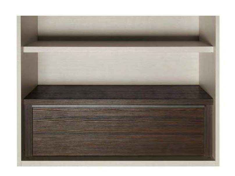
Brown Larch melamine sweater organiser

Deep drawer in Brown Larch, also available in Jute-effect, Linen-effect and Dark Oak melamine