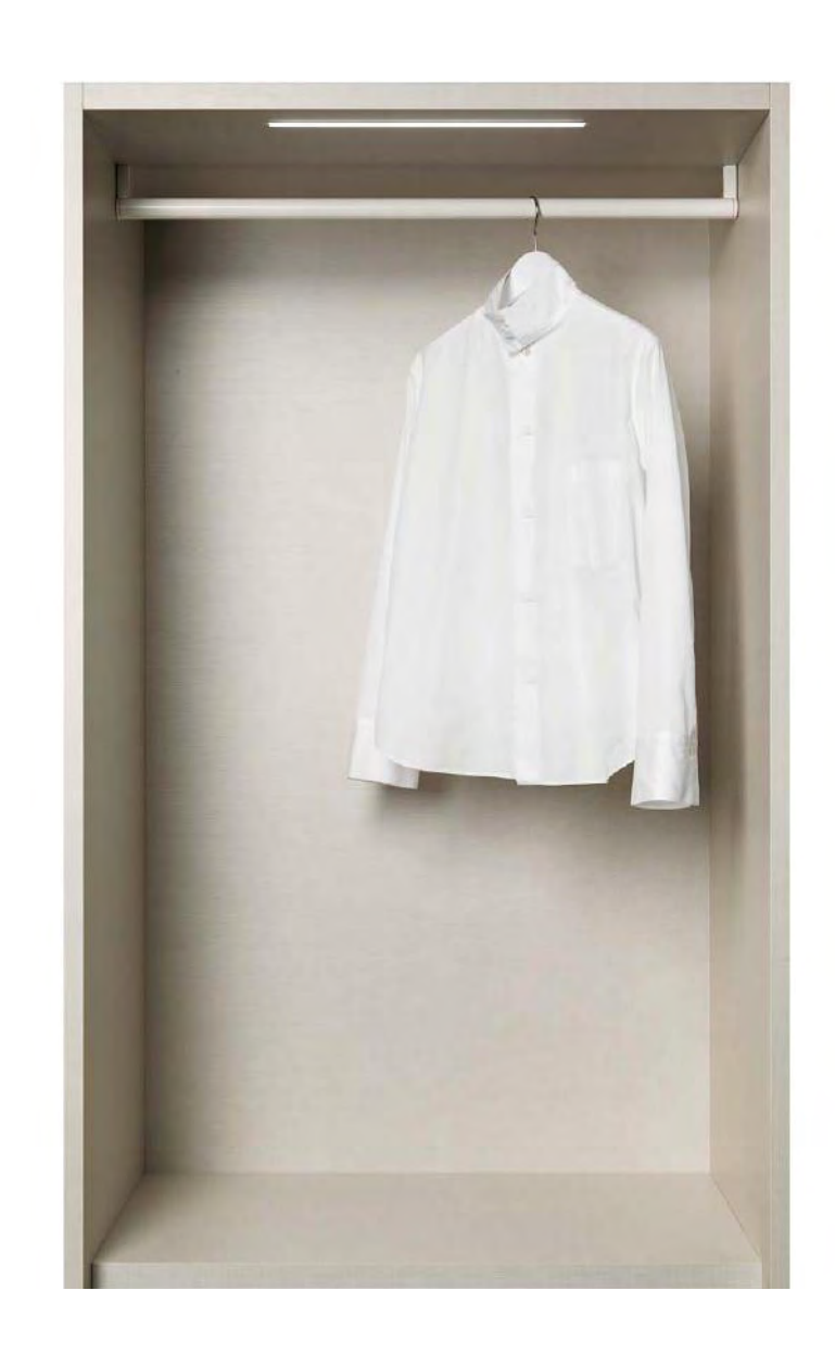
Upper top with flush-mounted led light