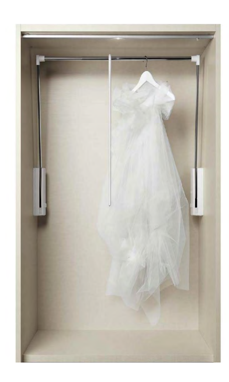
* Linen-effect module with white clothes-lift and exterior led light on the upper top

* White finish pullout trouser rack for Linen-effect melamine structure and Burnished finish for Jute-effect melamine structure